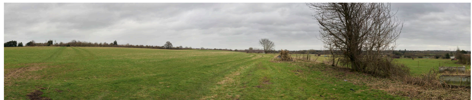
01.8 Final camera matched photomontage