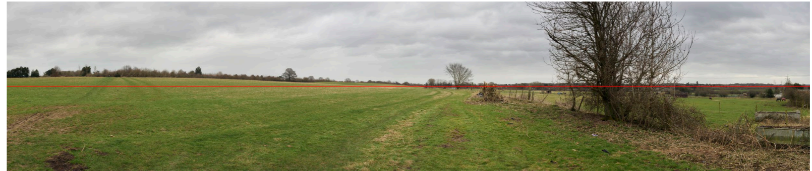
01.5 Screen grab of calculated horizon line