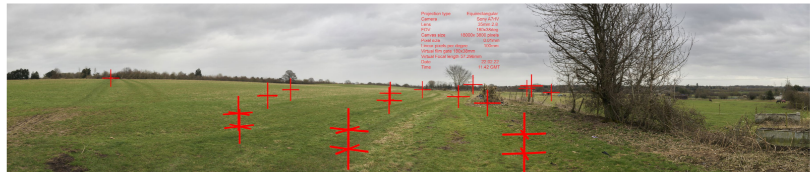
01.6 Screen grab of camera matching to OS data