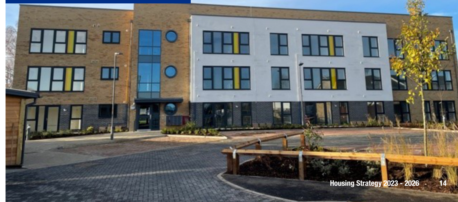
Warner House-a Council redevelopment of a former sheltered housing scheme