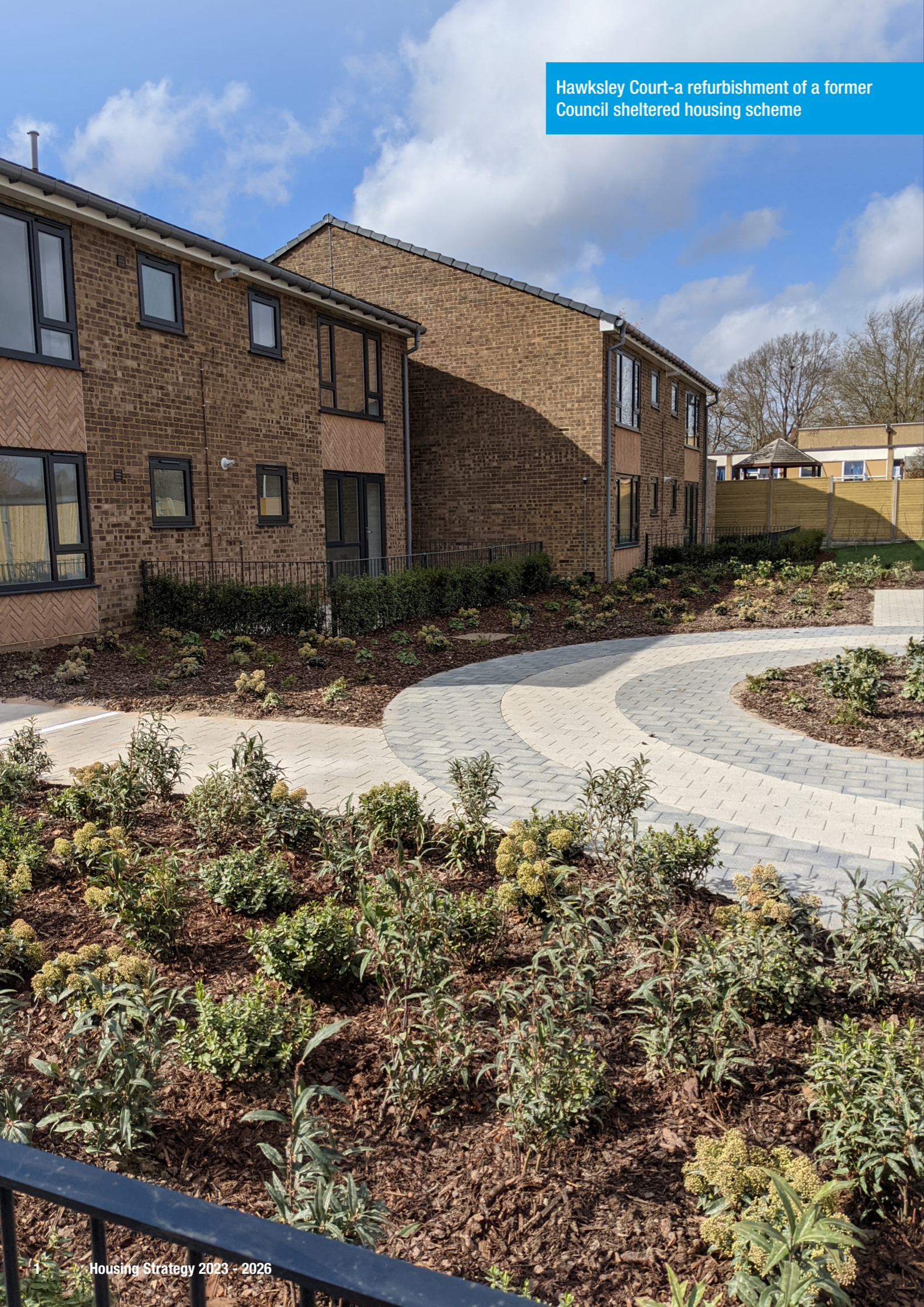
Hawksley Court-a refurbishment of a former Council sheltered housing scheme