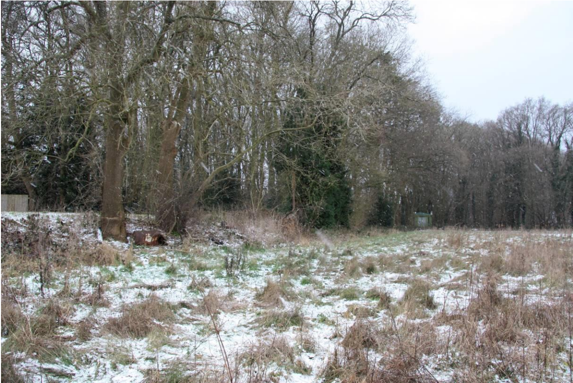
Image EDP 11: View of Beeches Bottom Dyke from within the site, looking south. To the left is a level landscaped area to the back of 138 St Albans road where the dyke was identified through trenching. The now infilled stretch extends into the woodland. the site is level ground and does not form part of the scheduling but lies in an area of potential archaeology identified in the HER. No earthworks were noted in this area.