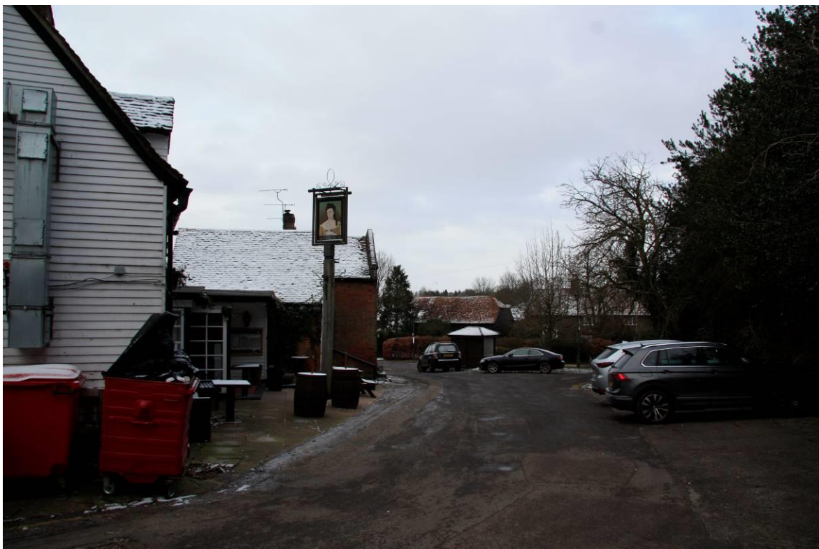
Image EDP 7: View of the relationship of the church to the 'historic core' of the village, looking south-west towards the site, which cannot readily be made out.