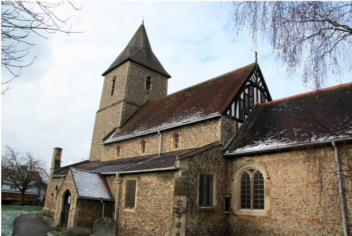
Image EDP 6: View of the Grade II* listed church of St Leonard, from its churchyard, looking north-west.