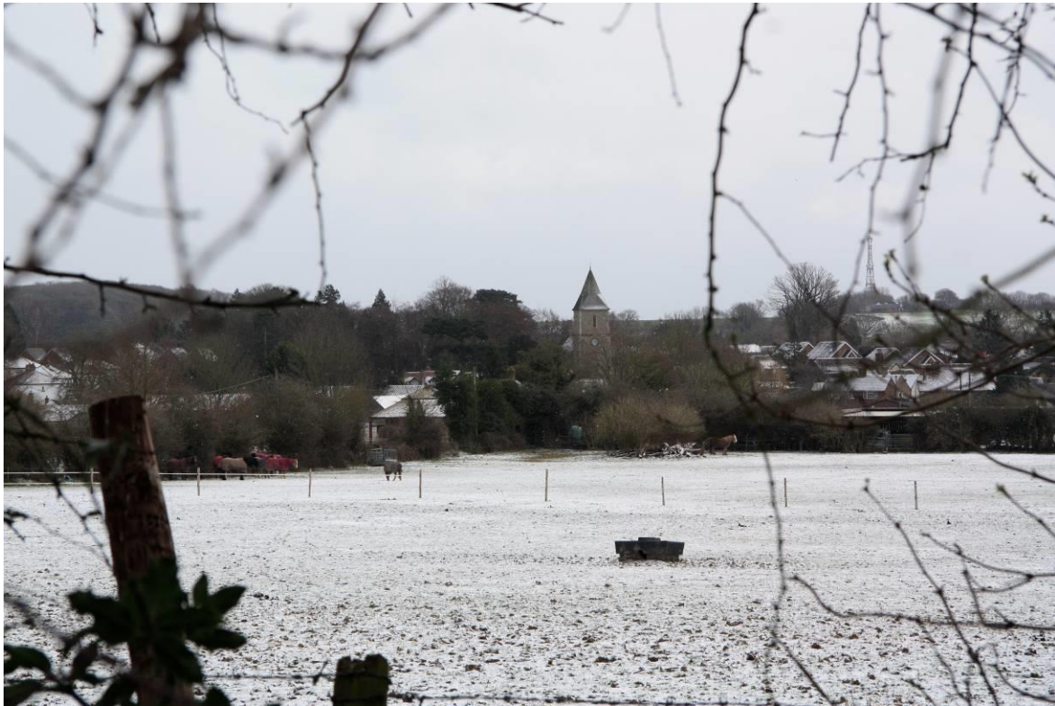
Image EDP 8: View towards the church across the northern part of the site from Sandridgebury Lane, looking east at a focal length of 50mm.