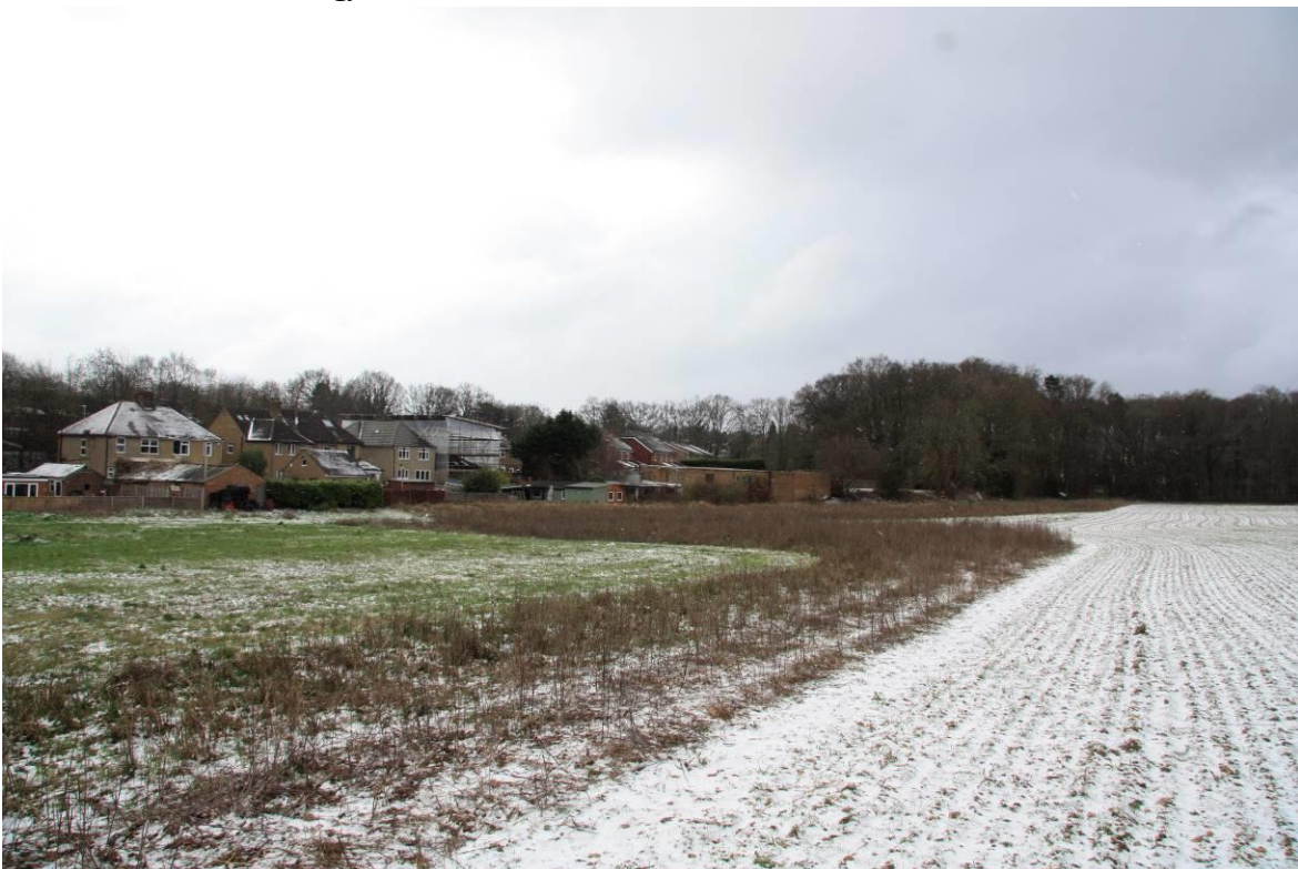
Image EDP 12: Broader view towards Beeches Bottom Dyke looking south. Showing the field within the site, and the rear of properties forming its setting along St Albans Road.