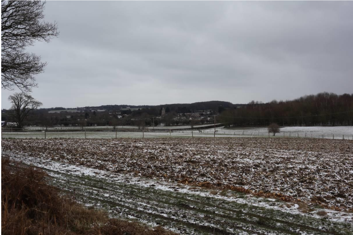
Image EDP 9: View towards the church across the northern part of the site from Sandridgebury Lane, looking north-east.