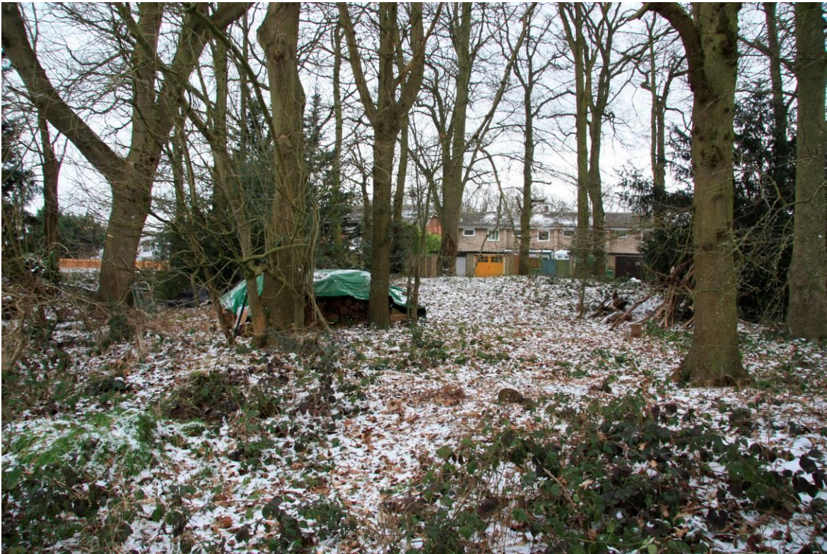
Image EDP 10: The Beeches Bottom Dyke scheduled monument lies in this area of woodland to the south of site, although this is not readily discernible, looking south-east.