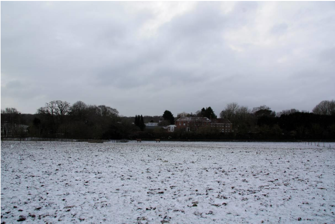
Image EDP 4: View of Sandridgebury house from the north, looking south. This also shows the well enclosed nature of its surroundings.