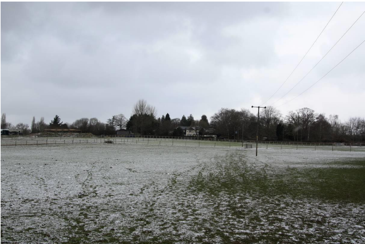
Image EDP 5: Longer view towards Sandridgebury from the east. None of the listed buildings can be seen, demonstrating its well-enclosed nature.