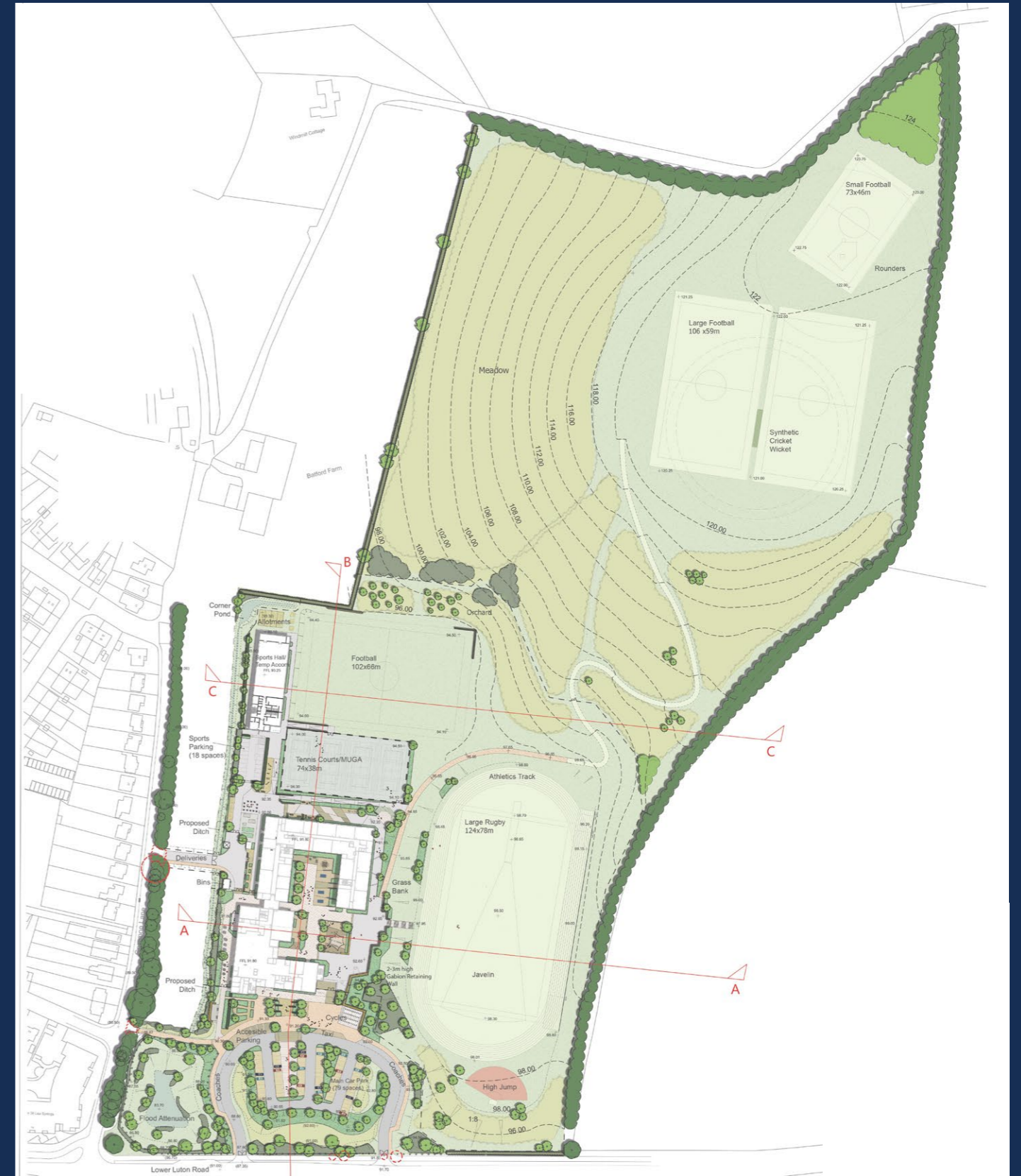
Submitted Landscape Masterplan for Katherine Warington School

The Site would provide a critical mass of local school age children for the proposed nearby Secondary School (to the immediate east of the site), allowing a significant proportion of trips to be made by sustainable means, reducing the potential highway impact. The mixed-use nature of the proposals for the Site would also encourage future residents to use on-site facilities and thus reducing the need for off-site/private motor travel.